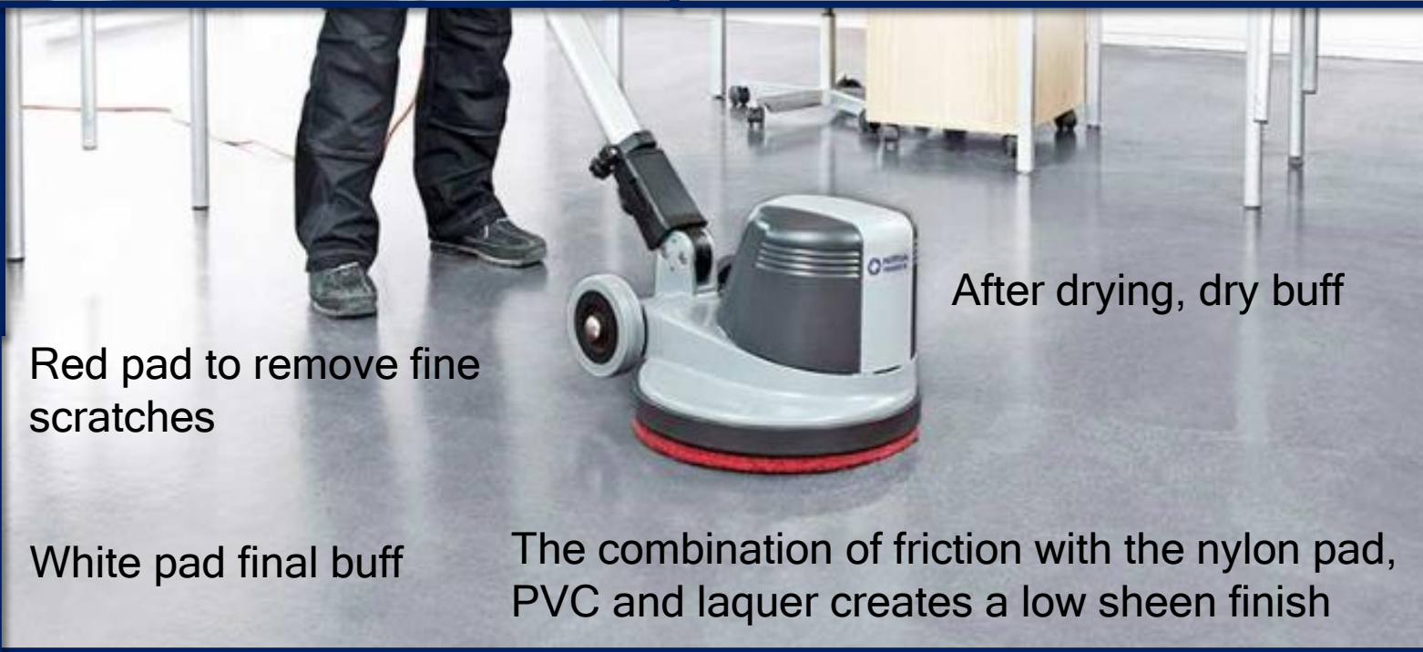
After drying, dry buff